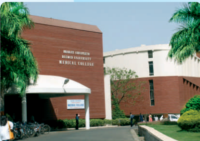
Medical College, Pune