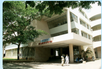
College of Ayurved, Pune