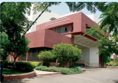
Homoeopathic Medical College, Pune