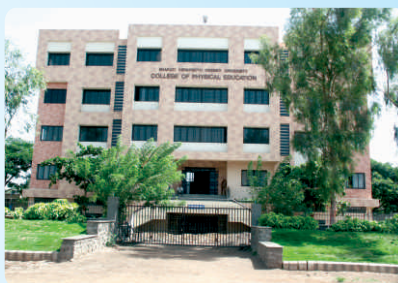
College of Physical Education, Pune