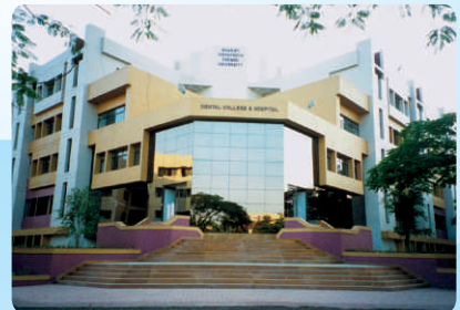
Dental College & Hospital, Pune