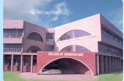
College of Architecture, Pune