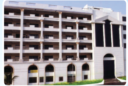
Yashwantrao Chavan Institute of Social Science Studies & Research, Pune