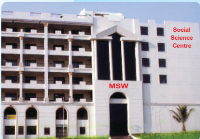
Social Science Centre (M.S.W.), Pune