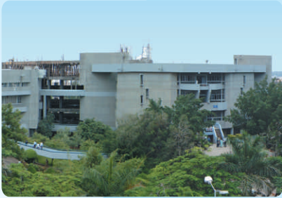
College of Engineering, Pune