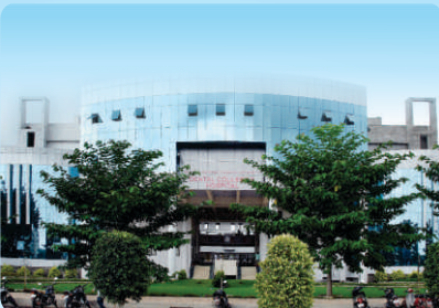
Dental College & Hospital, Sangli