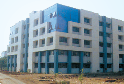
College of Nursing, Navi Mumbai