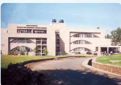
Institute of Hotel Management and Catering Technology, Pune