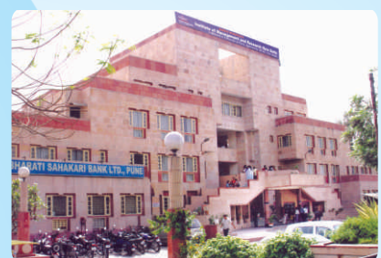
Institute of Management and Research, New Delhi