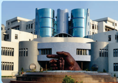
Medical College & Hospital, Sangli