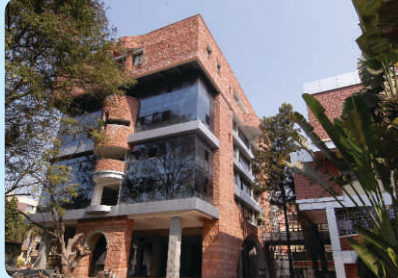
Centre for Research & Development in Pharmaceutical Sciences & Applied Chemistry, Pune