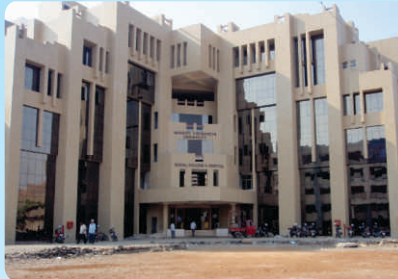
Dental College & Hospital, Navi Mumbai