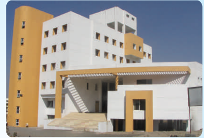
Rajiv Gandhi Institute of Information Technology and Biotechnology, Pune