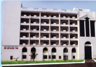
New Law College, Pune