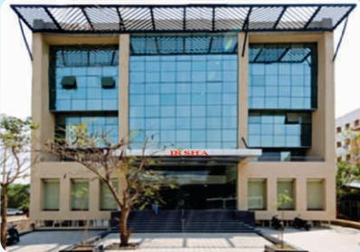
Interactive Research School for Health Affairs (IRSHA), Pune