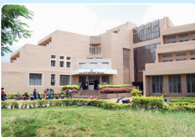
Institute of Management, Kolhapur