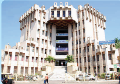
Institute of Management and Rural Development Admin., Sangli