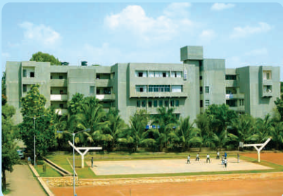
Institute of Management and Entrepreneurship Development, Pune