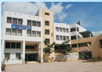
Abhijit Kadam Institute of Management and Social Sciences, Solapur