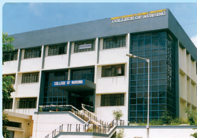
College of Nursing, Pune