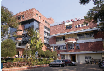
Poona College of Pharmacy, Pune