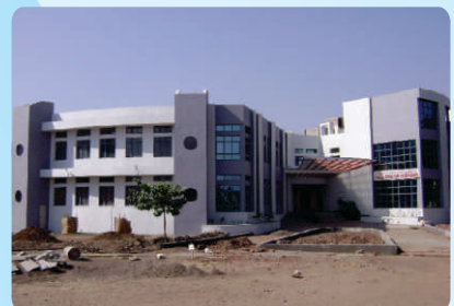
College of Nursing, Sangli