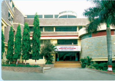
Y.M. College of Arts, Science and Commerce, Pune