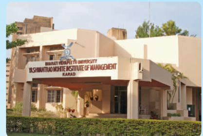
Yashwantrao Mohite Institute of Management, Karad