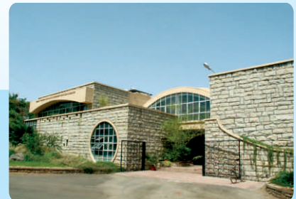
Institute of Environment Education and Research, Pune