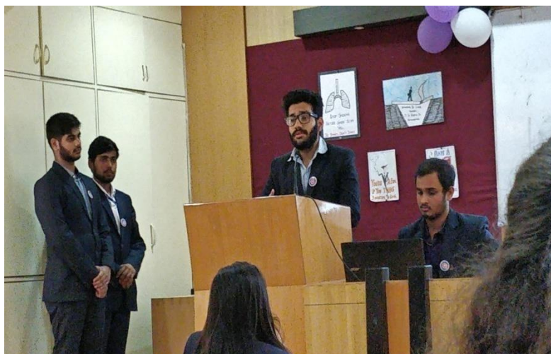
Volunteer delivering speech