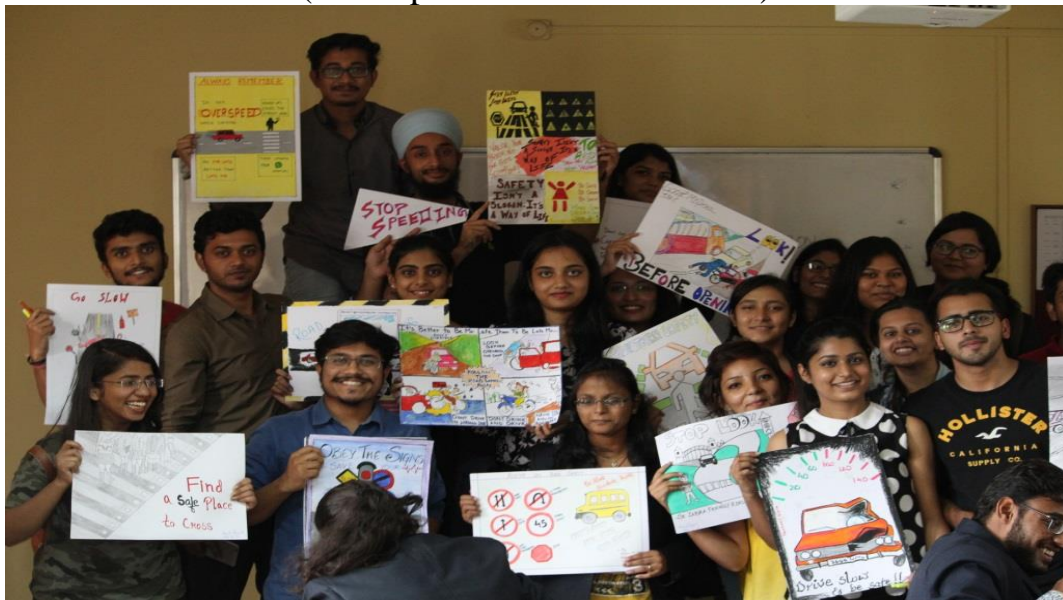
(Participants with their Posters)