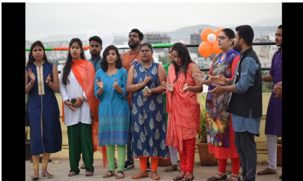
Patriotic song by NSS volunteers