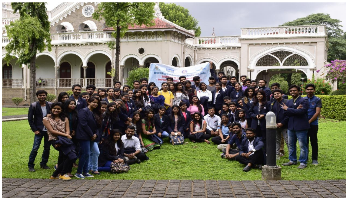
NSS Volunteers of BVDU IMED, Pune during the visit to Aga Khan Palace