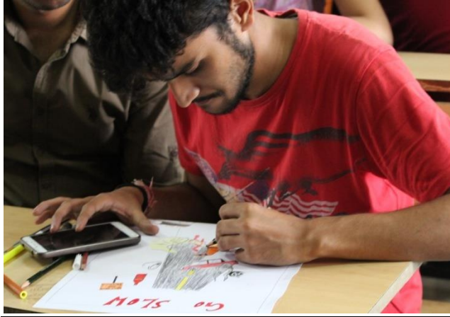
(Participant during Poster in making)