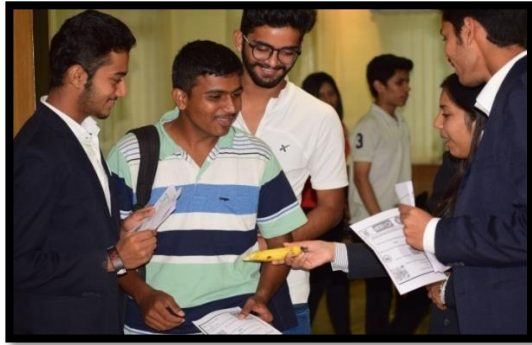
Distribution of banana after the activity.