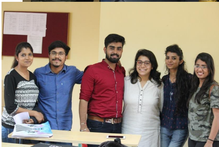
(BBA 3 rd Year – Div A)