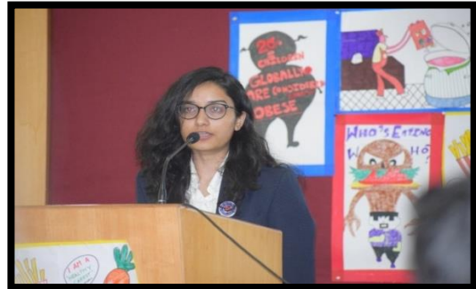
Volunteer spreading awareness on harmful effects of junk food.