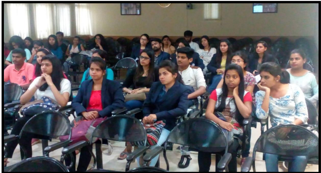
Volunteers present during the awareness activity.