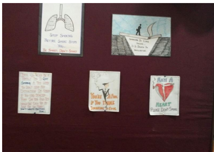
Posters on smoking awareness