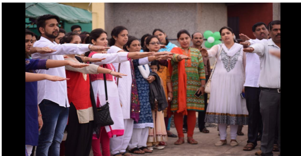
SWACCHA BHARAT pledge on the occasion of independence day