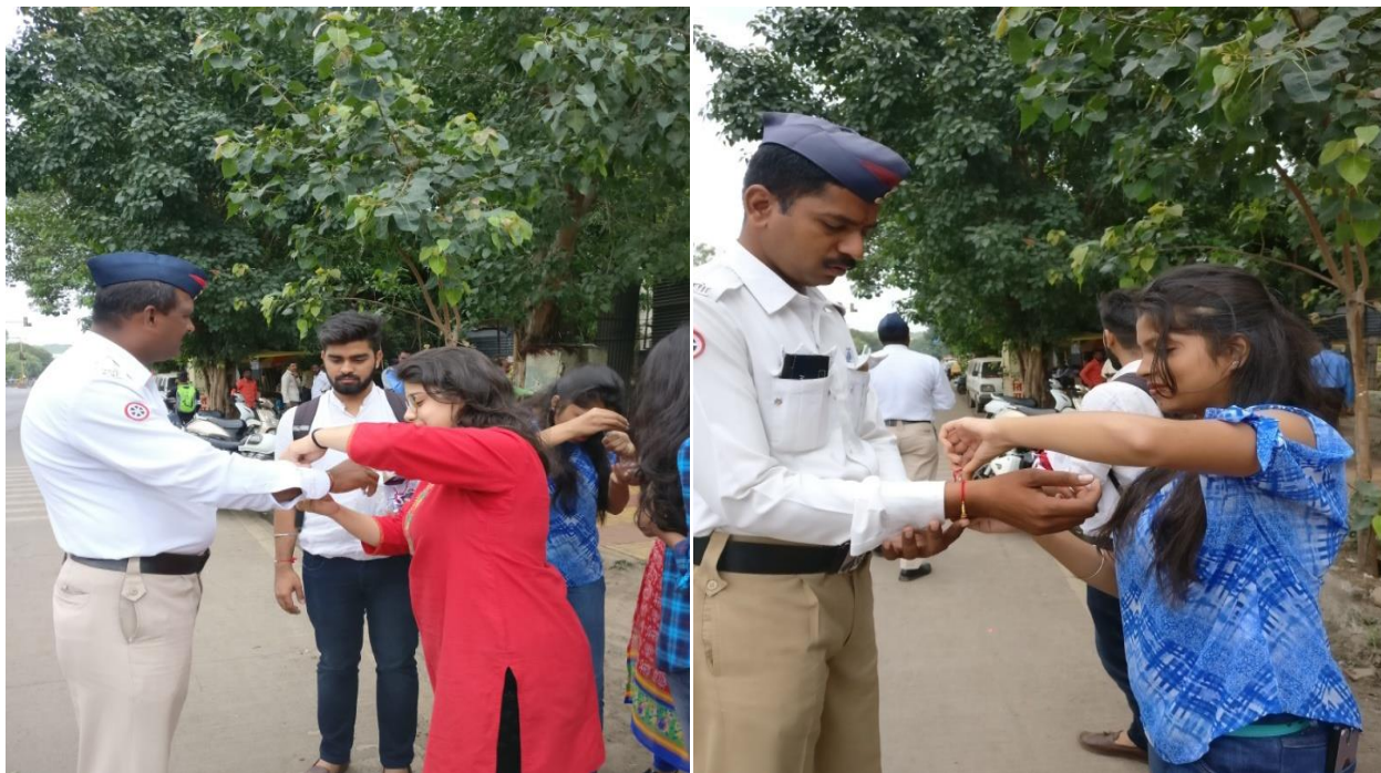
IMED students tying Rakhi to policeman on duty during Raksha Bandhan day.