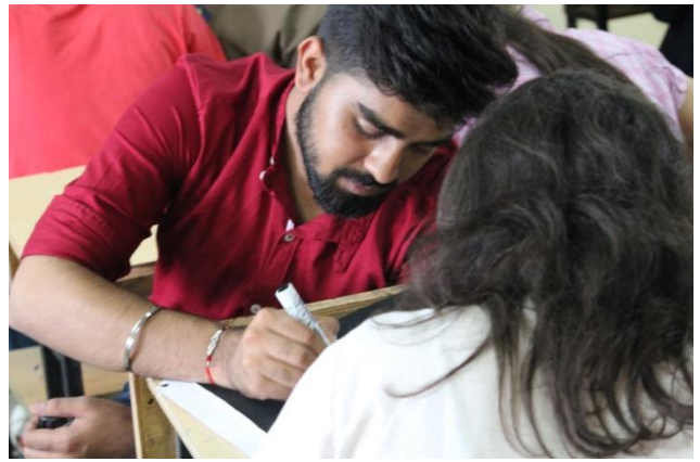
(Poster in making)