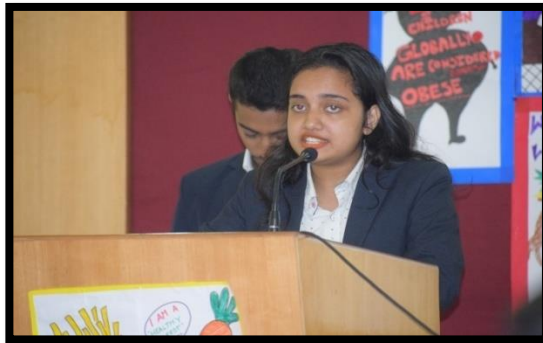
Volunteer spreading awareness on harmful effects of junk food.