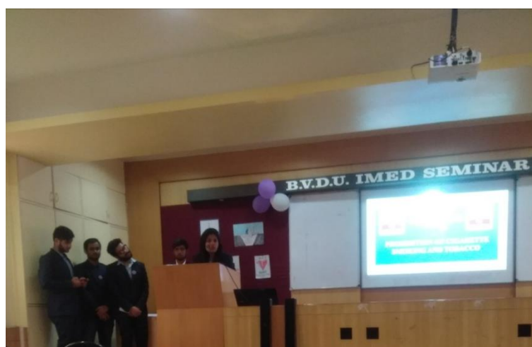
Volunteers showing presentation