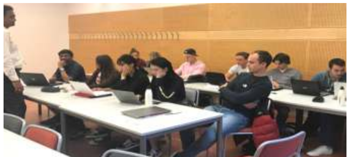
The session on Group Influence and Consumer Behavior in Progress at Linnaeus University.