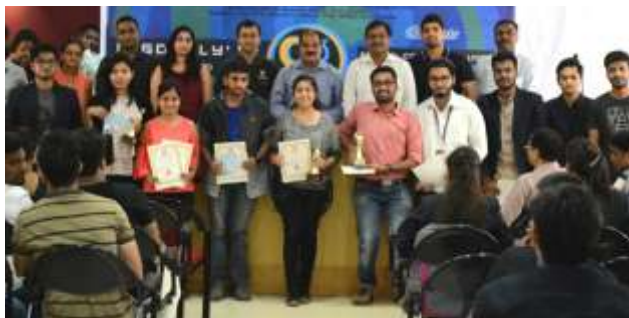
Winners of C-Googly Event, with Guests, Directors and Co-ordinator

'allevents.in'; "PuneTimes"; "Scootywala"; "La-kheer Deli" and "Talwalkars"; allevents.in has sponsored T-Shirts for student coordinator while Scootywala sponsored Winners Trophy and La-kheer Deli sponsored food and Pune Times helped in marketing of event on social media as kind sponsorship and Talwalkars in terms of vouchers to winners and participants.