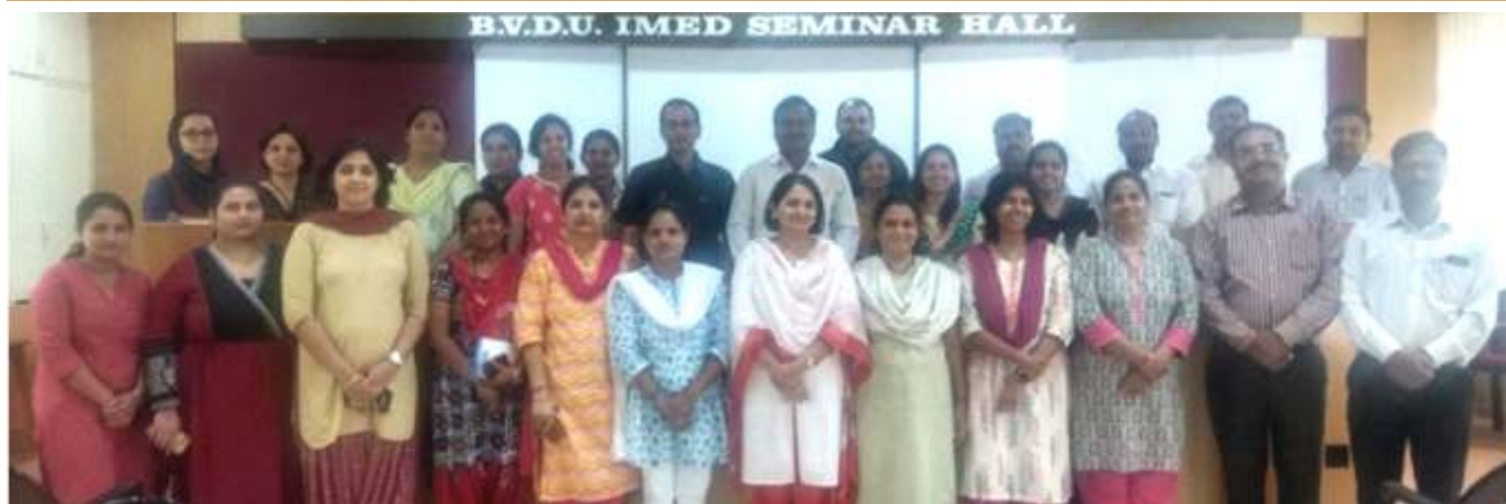
Participants of FDP on Teaching Methodology, Research and Consultancy