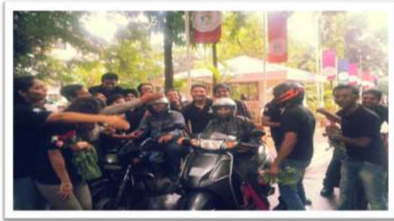
(Team distributing Red rose and Pamphlet on Importance of helmet to the riders. )