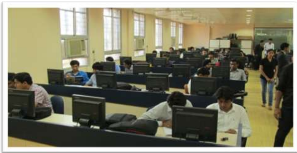
(Students preparing their presentation for the competition.)