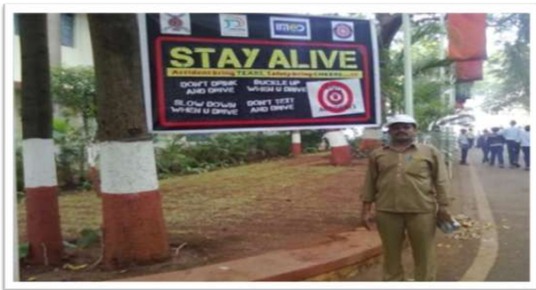
(Banner displayed for Road Safety Awareness at Bharati Vidyapeeth University, Erandwane, Pune)