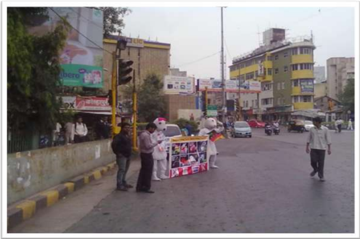
(Volunteers of IMED with Zoo – Zoo character at Alka talkies chowk.)