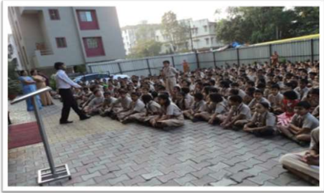
(Volunteers of IMED awaring the school students on Importance of road safety)