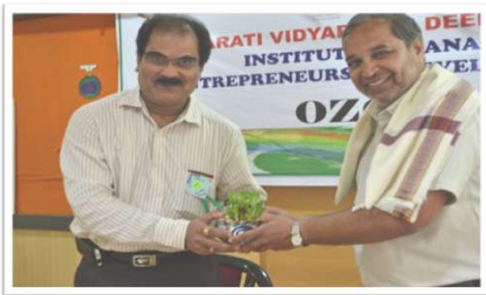
Ozone day celebrations at IMED