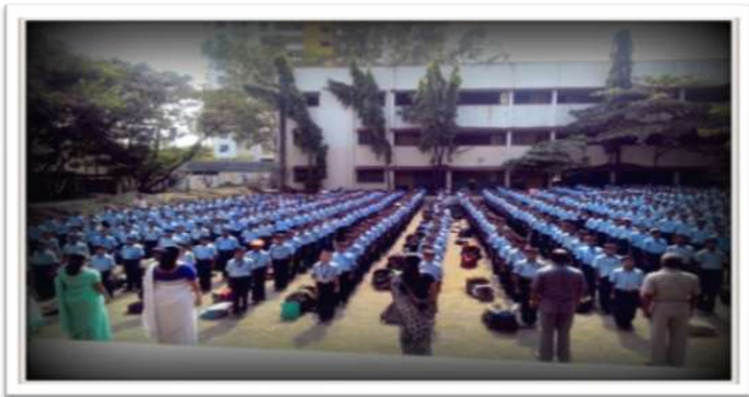
(Volunteers of IMED awaring the school students on Importance of road sadety)