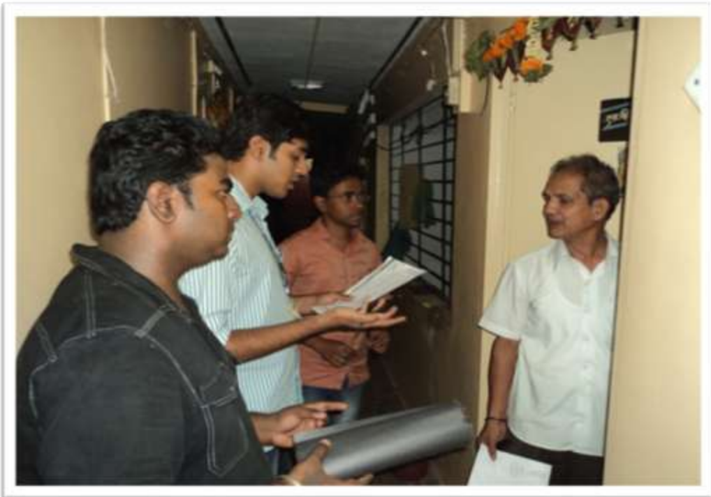
(Volunteers of IMED awaring the society people on Importance of road safety)