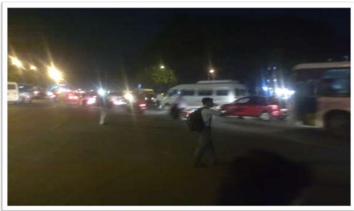
(Faculties and volunteers of IMED controlling Traffic at Karve Putla chowk.)