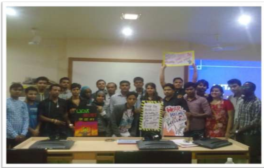
(Group of Foreign Students with the posters related to road safety.)