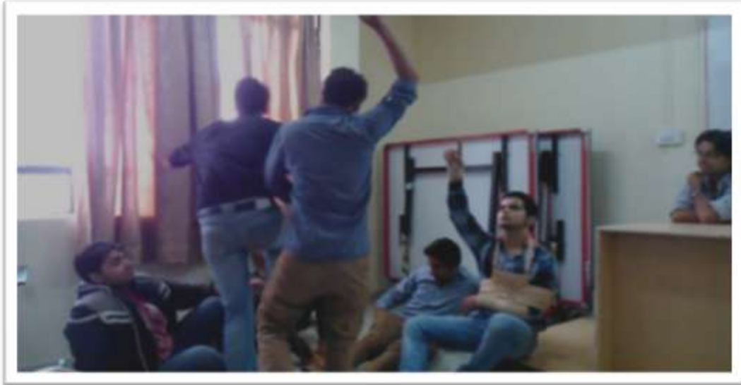
(Students of BBA 2nd year performing Role play on Road safety)