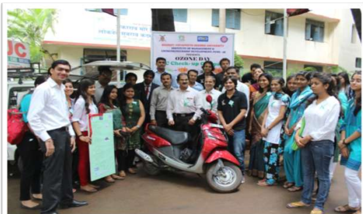
(Inauguration of PUC Checkup Camp)