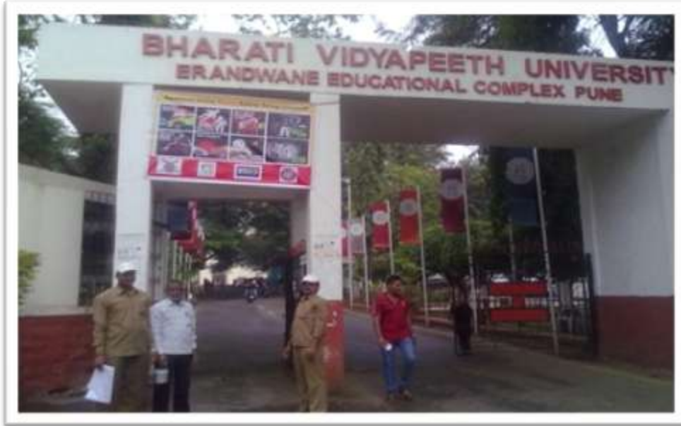
(Banner displayed for Road Safety Awareness at Bharati Vidyapeeth University, Erandwane, Pune)

We have designed banners on the importance of Traffic rules and displayed it all over Pune at different spots. We used the banner at Bharati Vidyapeeth Erandwane campus, Null stop, Bharati Vidyapeeth Katraj campus as well as at Om Sai Dining Hall.