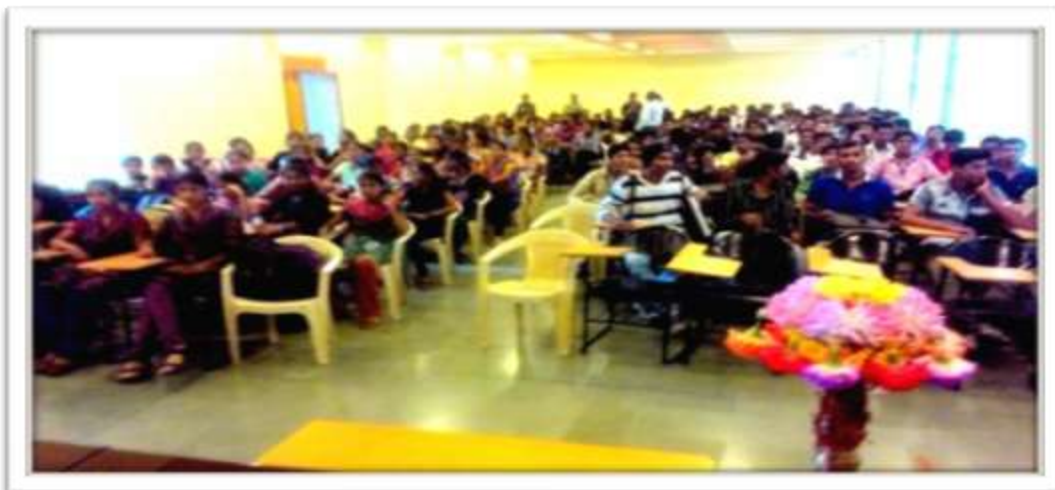
(Volunteers of IMED awaring the college students on Importance of road safety)