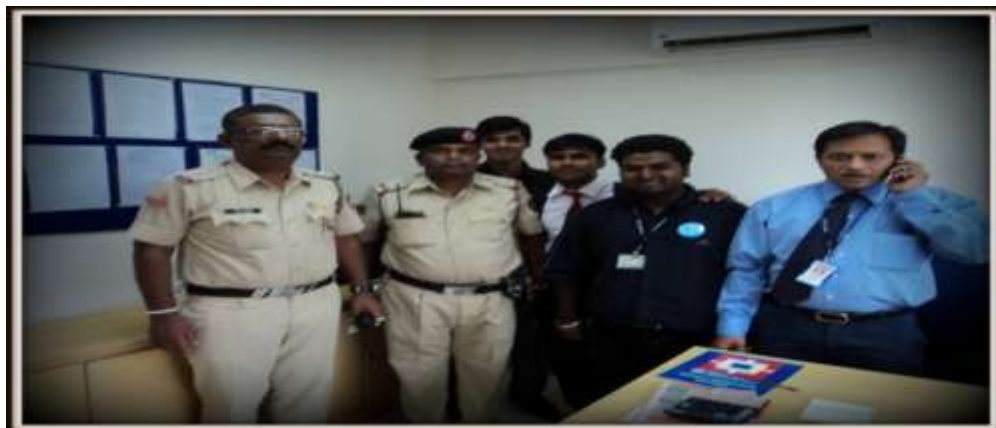
(Voluneteers of Imed and Police Inspector OF Warje division with Manager of HDFC BANK at warje.)