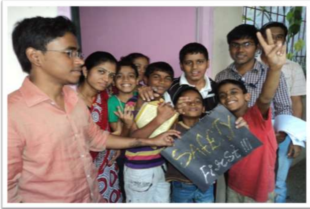
(Volunteers of IMED awaring the society people on Importance of road safety)