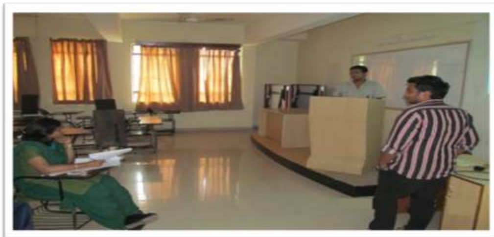
(Students presenting the PPT they have made to the judges)