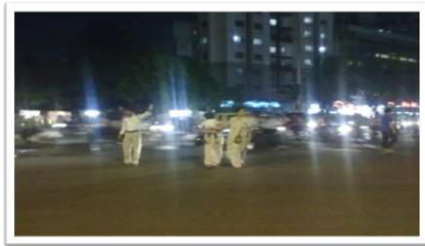
(Faculty of IMED helping an old lady in crossing the road.)