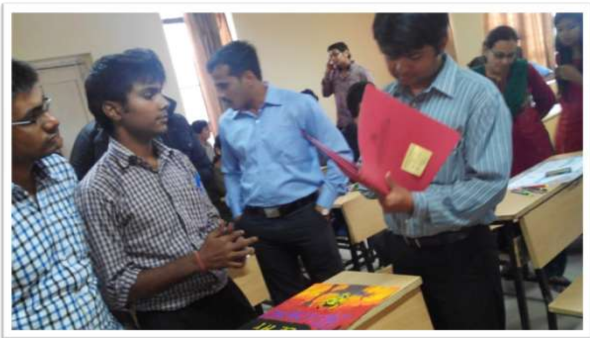
(Judges marking the creativity of student in the posters.)

The event was praised by the faculties and enjoyed by the participants. Director of IMED congratulated the organizing team for the event and appreciated their work and it was a grand success.