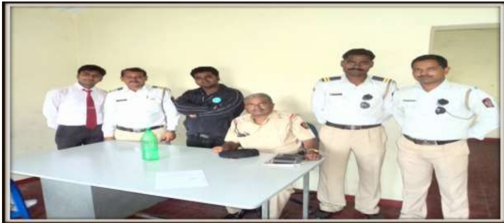
(Volunteers of IMED with Police Inspector of warje division for road safety Awareness campaign.)

We have approached more than 41,000 people all over Maharashtra and have aware them for following the road safety rules by different media.