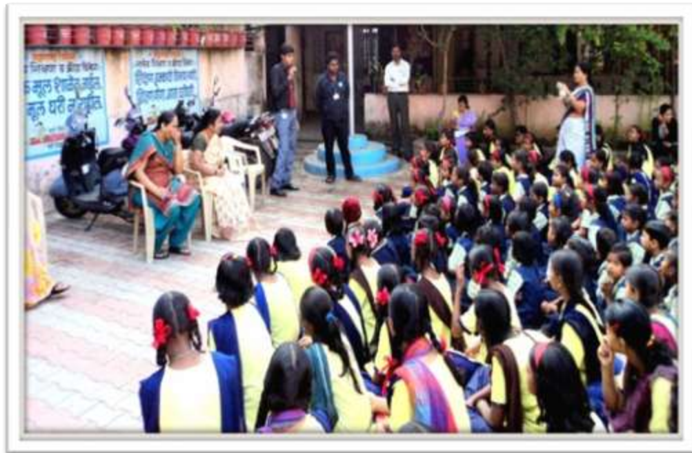
(Volunteers of IMED awaring the school students on Importance of road safety)