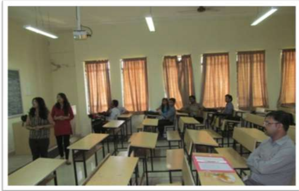
(Students presenting the PPT they have made to the judges)