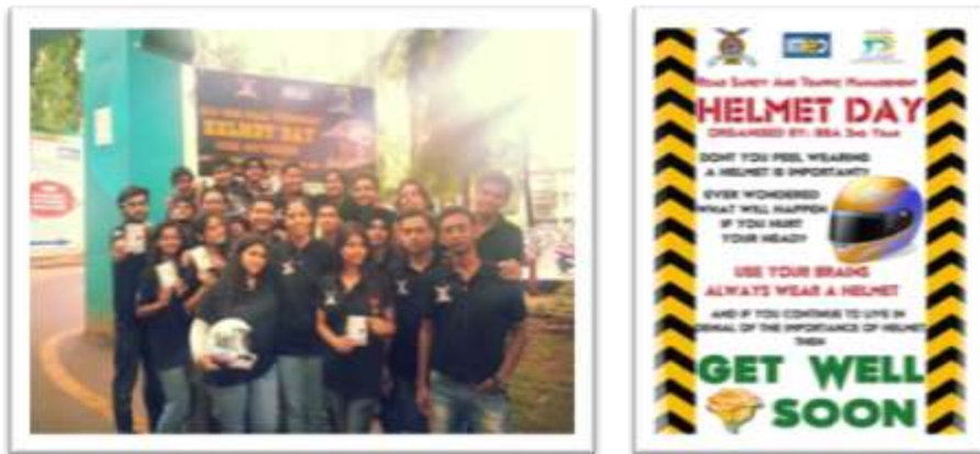
(Organizing Team of the for Helmet day along with Helmet Day Card)