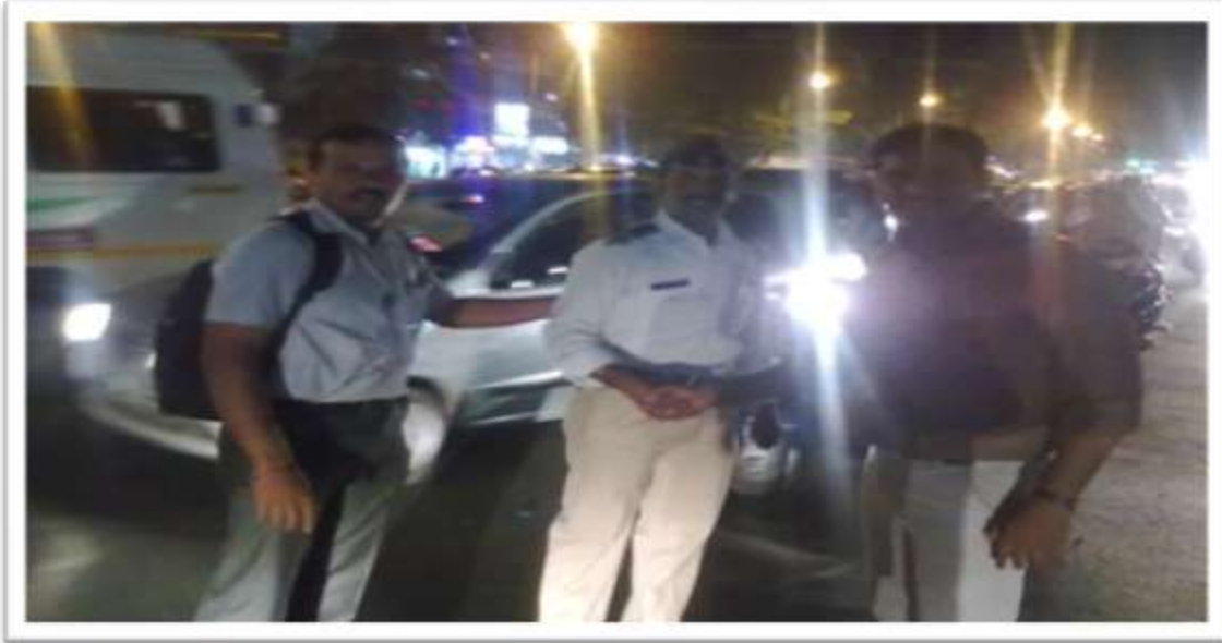
(Policemen congratulating the efforts done by Faculties of BVDU, IMED.)

While handling this real life situation, faculties got motivating comments like "Good Work", "Thanks", "Keep it up", etc from the citizens who got stuck in traffic jam from last 20-30 mins. Traffic police officer also appreciated the work done by the faculties and thanked them for their alertness and handling traffic smoothly.