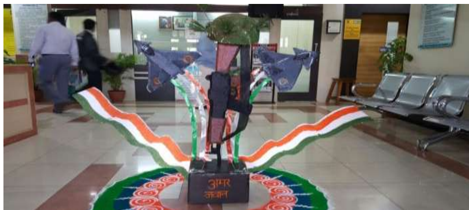
Excellent creativity shown by the students at the entrance of IMED