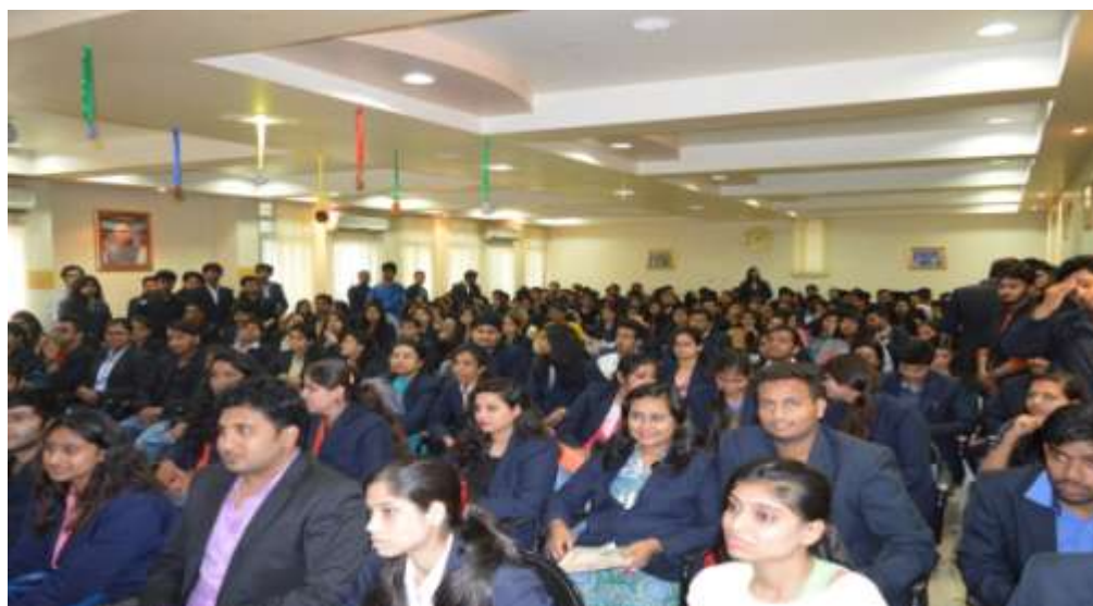
Participants of various competitions gathered at the venue of prize distribution ceremony