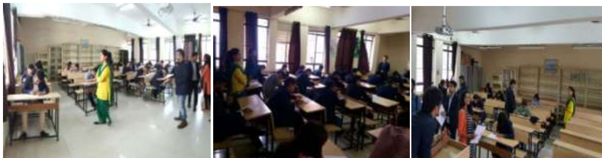
Students thinking and answering the Quiz

Quiz competition was held on 11th August 2016. It consists of different multiple choice questions based on history, great freedom fighters, independence history, etc. 67 students participated in quiz competition.