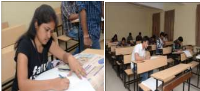
Students are in action

Patriotic poster making competition was held on 12 th August 2016. 28 students were participated.