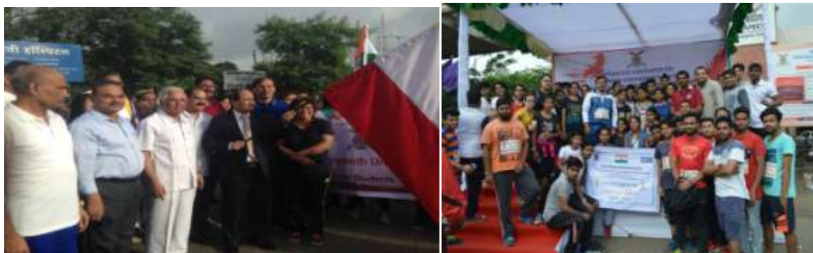
Active faculties and Students of IMED participated in 'Freedom Run'