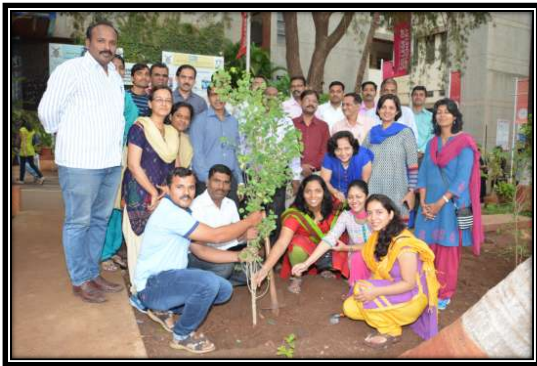
BVDU IMED Faculties during Tree Plantation drive at Erandwane Educational Campus.

The event was a successfully carried on with the vow taken by the staff of IMED to take care of the plants everyday to contribute to the social cause of protecting our environment.