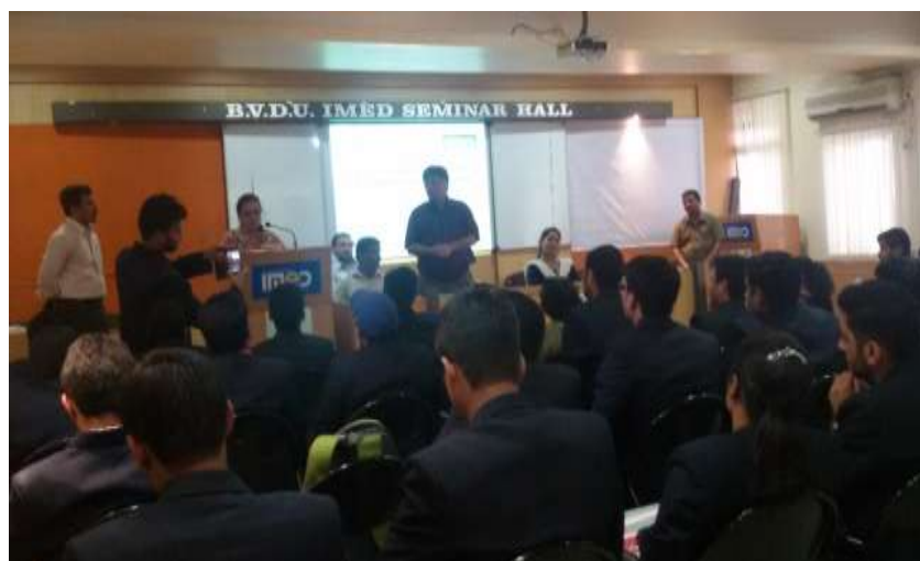
Faculties' and Students' enthusiasm for singing patriotic Song