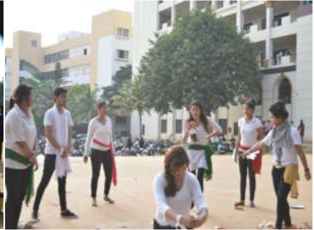
Winners of Street Play Competition: