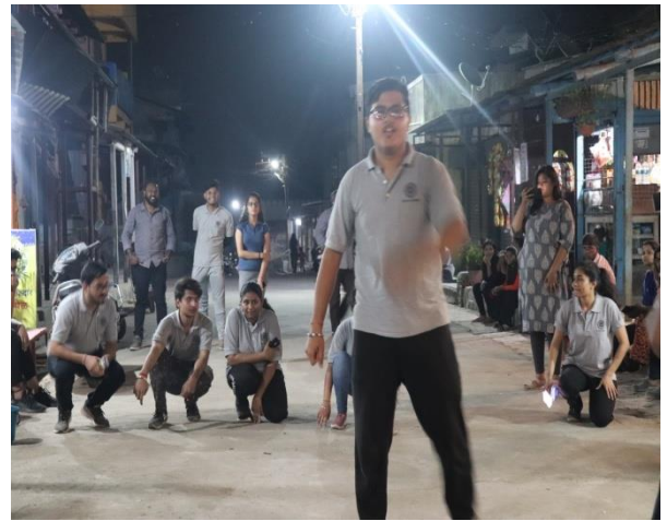
Volunteers presenting Street Play