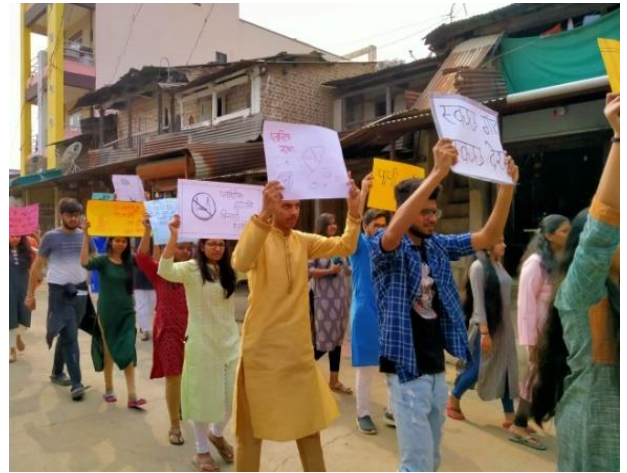
Rally and Paper bag Distribution