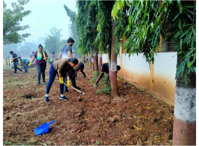
Cleanliness at school playground