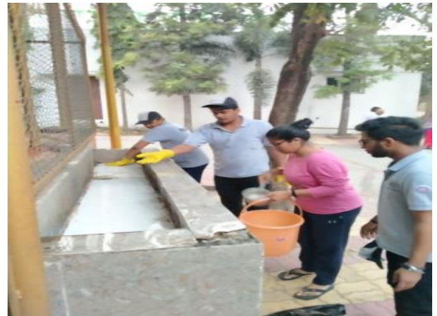
Cleanliness drive at Grampanchayat area