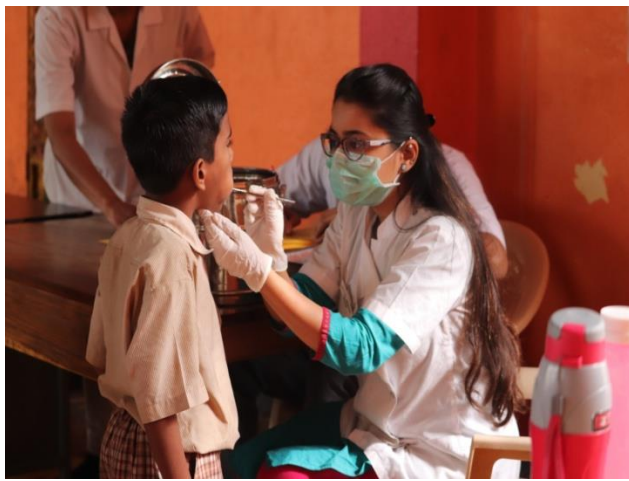
Dental Check up camp