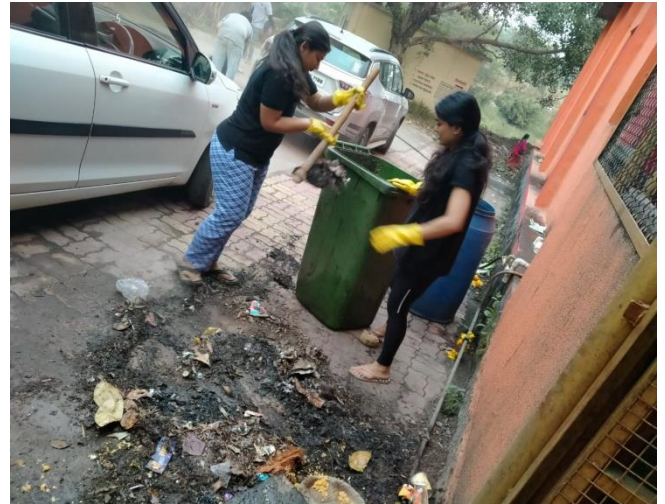
Cleanliness at Rodhkeshwar Temple