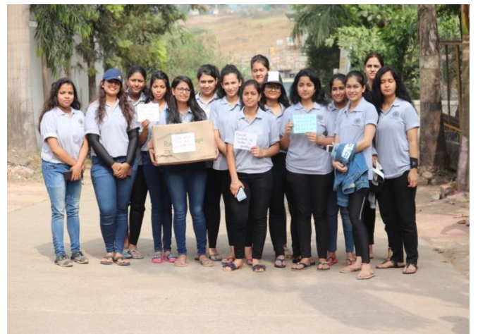
Girl volunteers during Sanitary Napkin Awareness