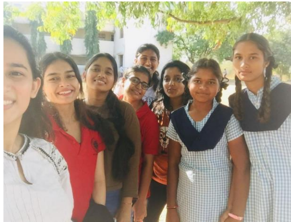
Self Defense Training for Girls