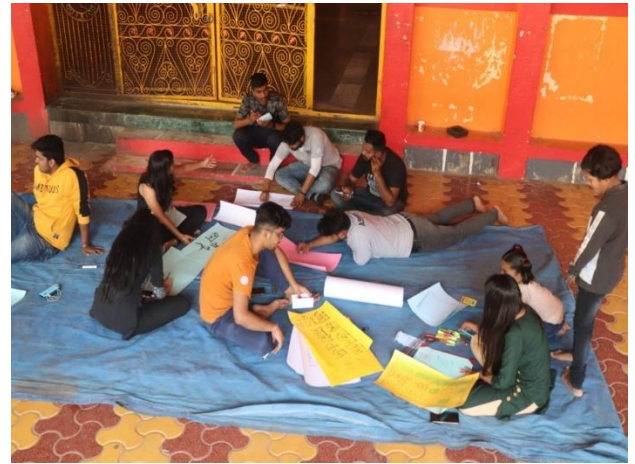
Poster and slogan making