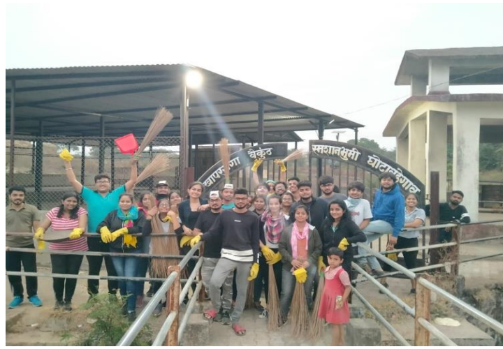
Cleanliness at Samshan Bhumi, Ghotawade