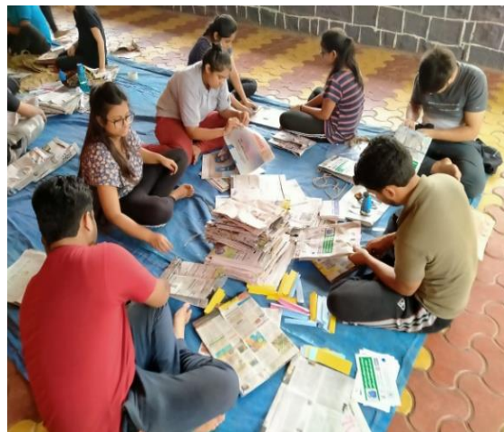
Paper Bag workshop