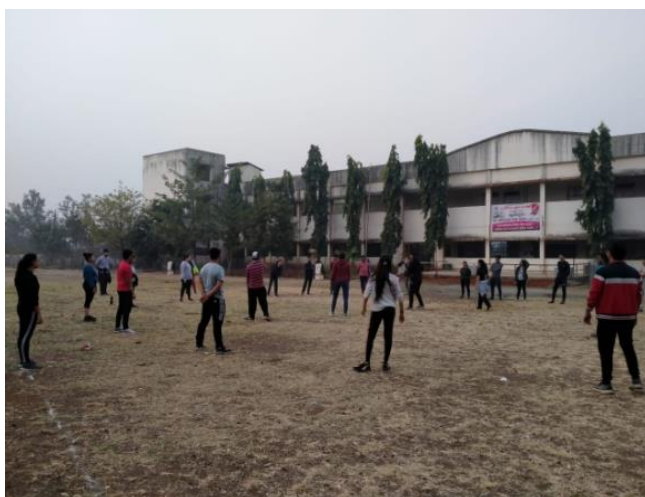
Team Building Games