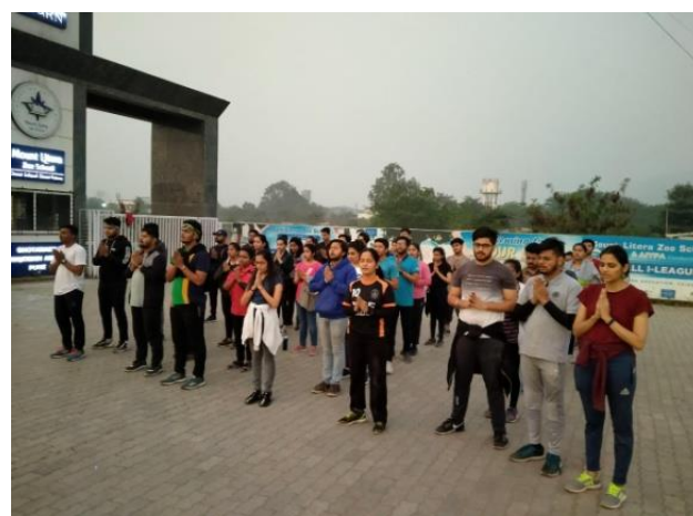
Volunteers during Yoga and Exercise in morning