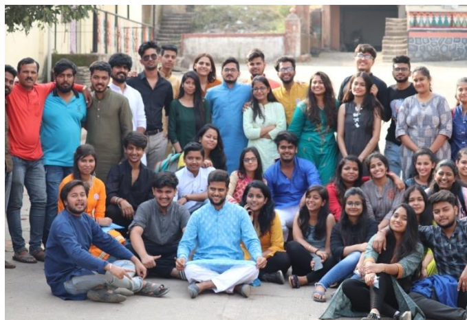
Back to college