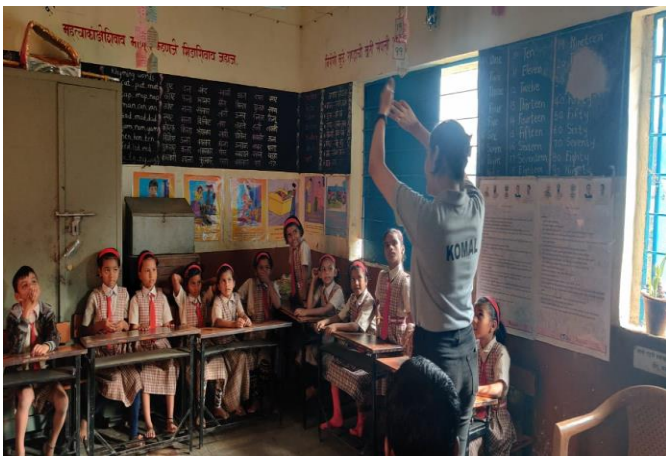
Activities at Jila Parishad School, Ghotawade