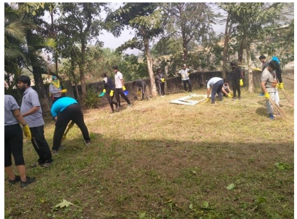
Cleanliness Drive at Begdewadi