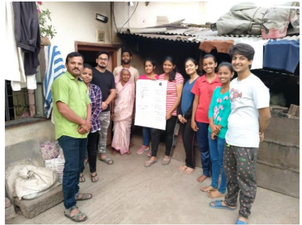
Rain Water Harvesting Survey and Awareness