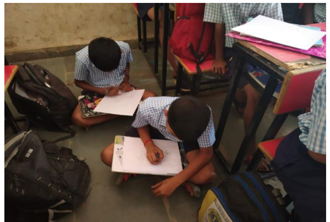
Poster Making competition at New English School