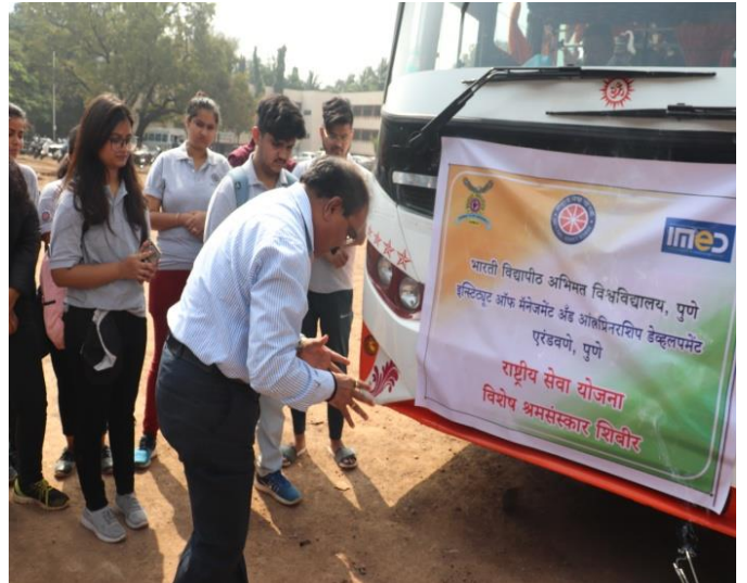
Inauguration of NSS Special Winter Camp