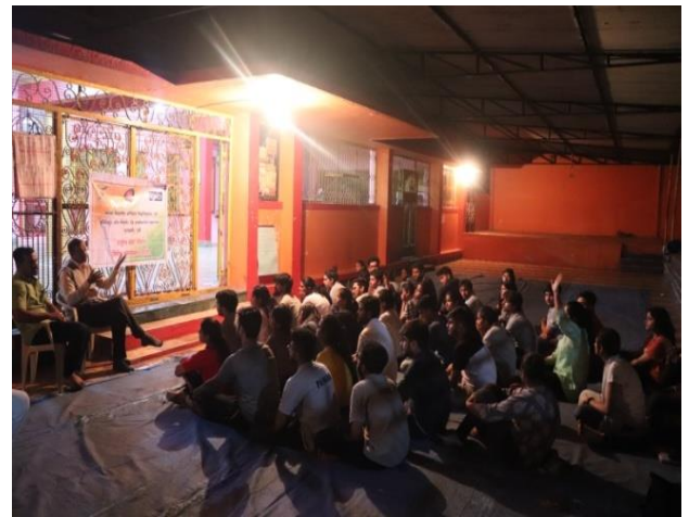
Volunteers during Guest Lectures