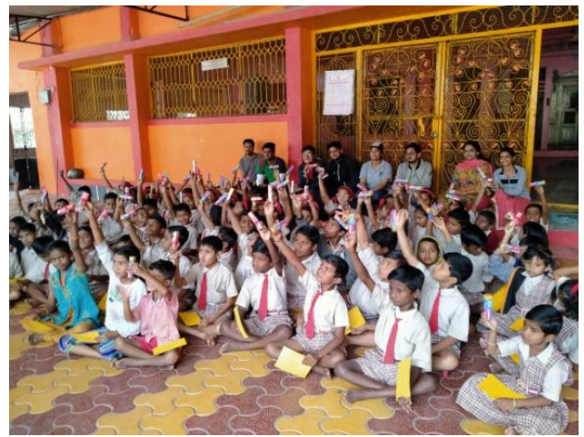
Distribution of Colgate to school students