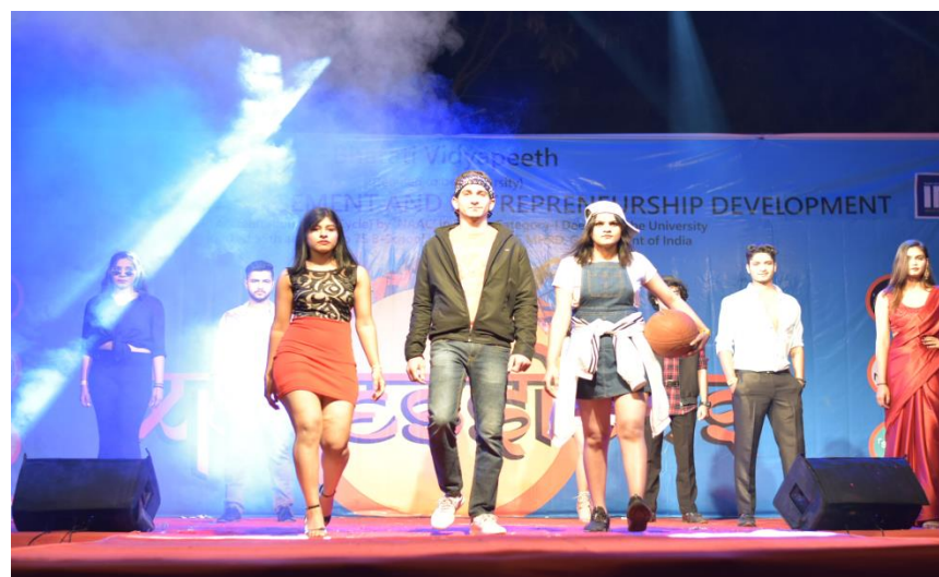
Fashion Show teams performing on the ramp