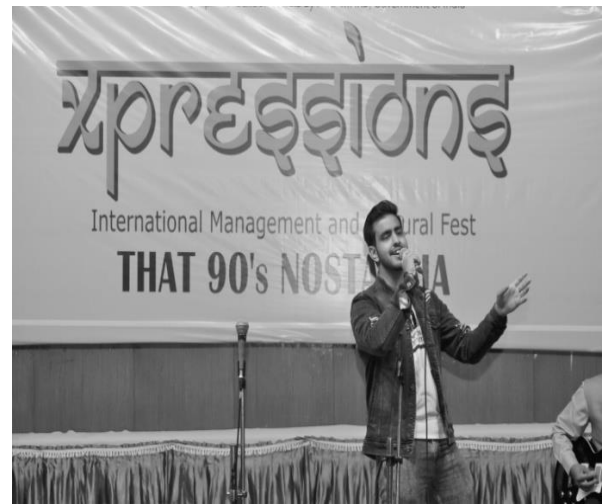
Solo and Duet Singing performances during Xpressions 2020