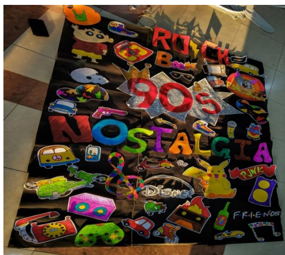
Creativity by IMED students

The inauguration was followed by the various events lined up for the day like –Tech paper presentation, Best Entrepreneur, AD MAD Show, Minute to win, Counter Strike, Treasure Hunt etc. All the events for the day had the enthusiastic presence and participation of students.