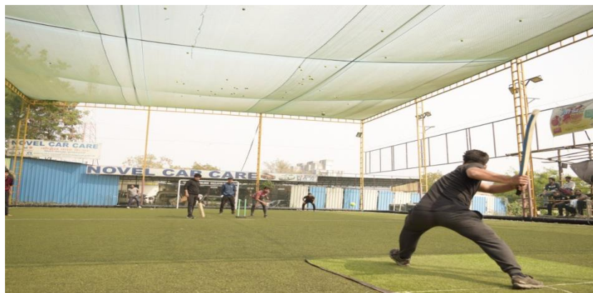
Event- Box Cricket