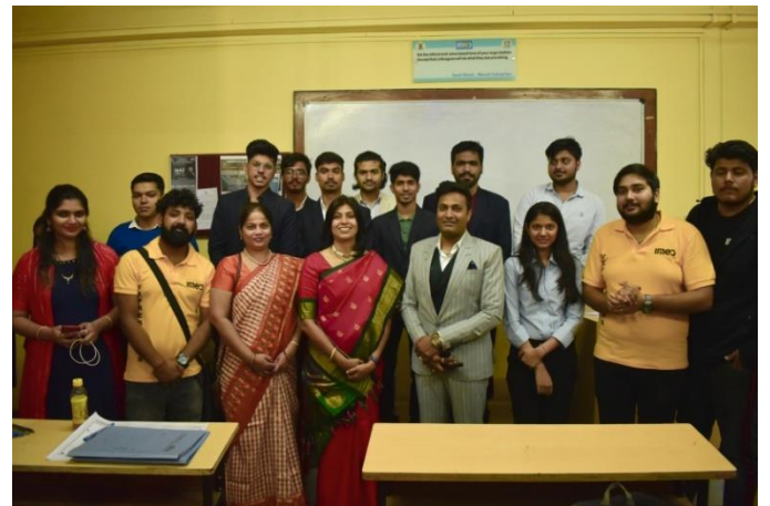
Participants of Face Painting event Participants of Best Entrepreneur event