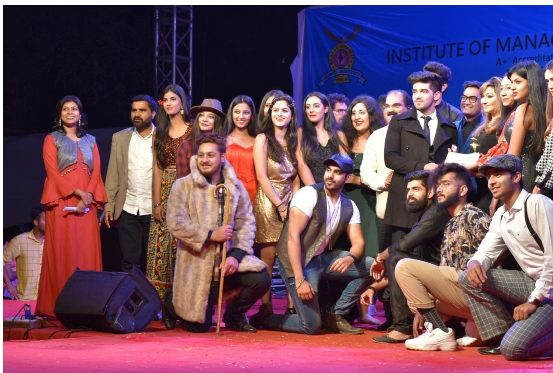
Runners Up team of Fashion Show -IMED receiving the trophy and gift hampers