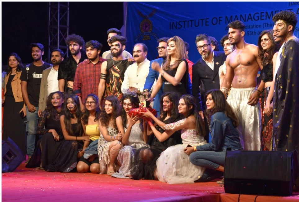
Winning team of Fashion Show -SKNCOE receiving the trophy and gift hampers