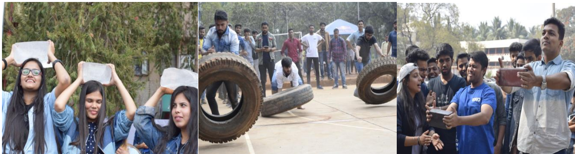
Participants enjoying the event Dare to Win