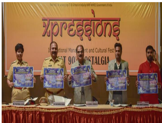
Inauguration of IMAC -IMED Music and Art Club

The inauguration was followed by the various events lined up for the day like –Tech paper presentation, Best Entrepreneur, AD MAD Show, Minute to win, Counter Strike, Treasure Hunt etc. All the events for the day had the enthusiastic presence and participation of students.