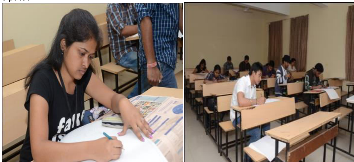
Students are in action

Patriotic poster making competition was held on 12 th August 2016. 28 students were participated.