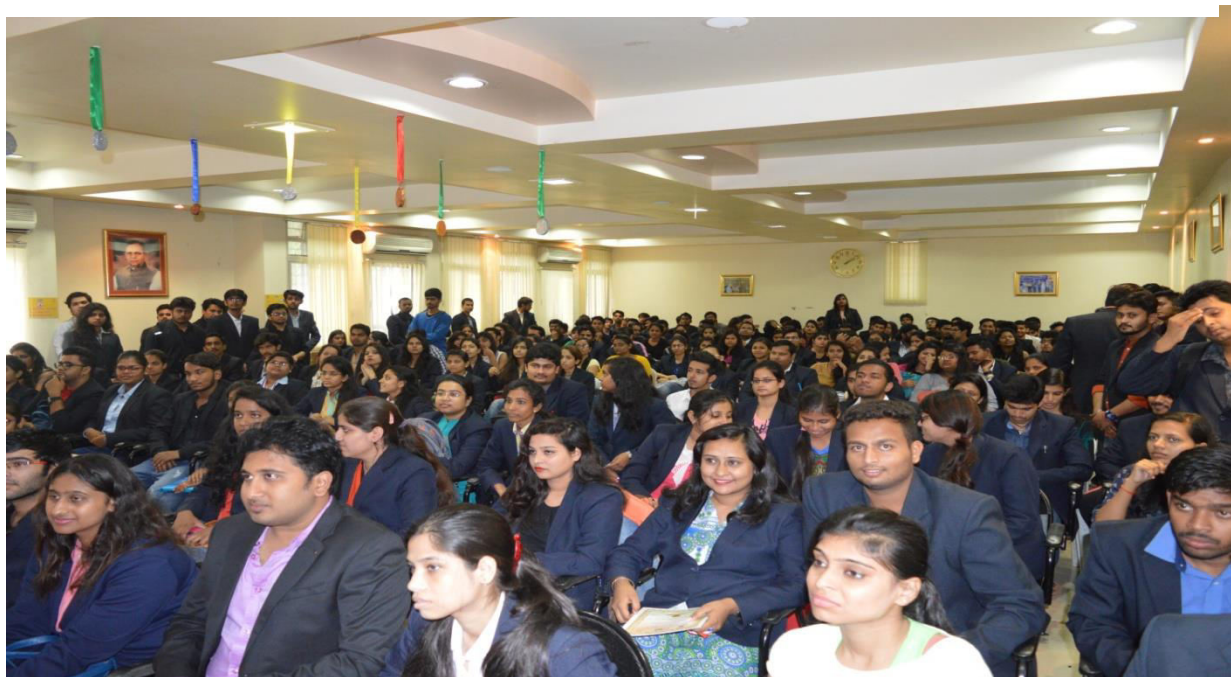
Winners as well as students gathering at the venue of prize distribution ceremony