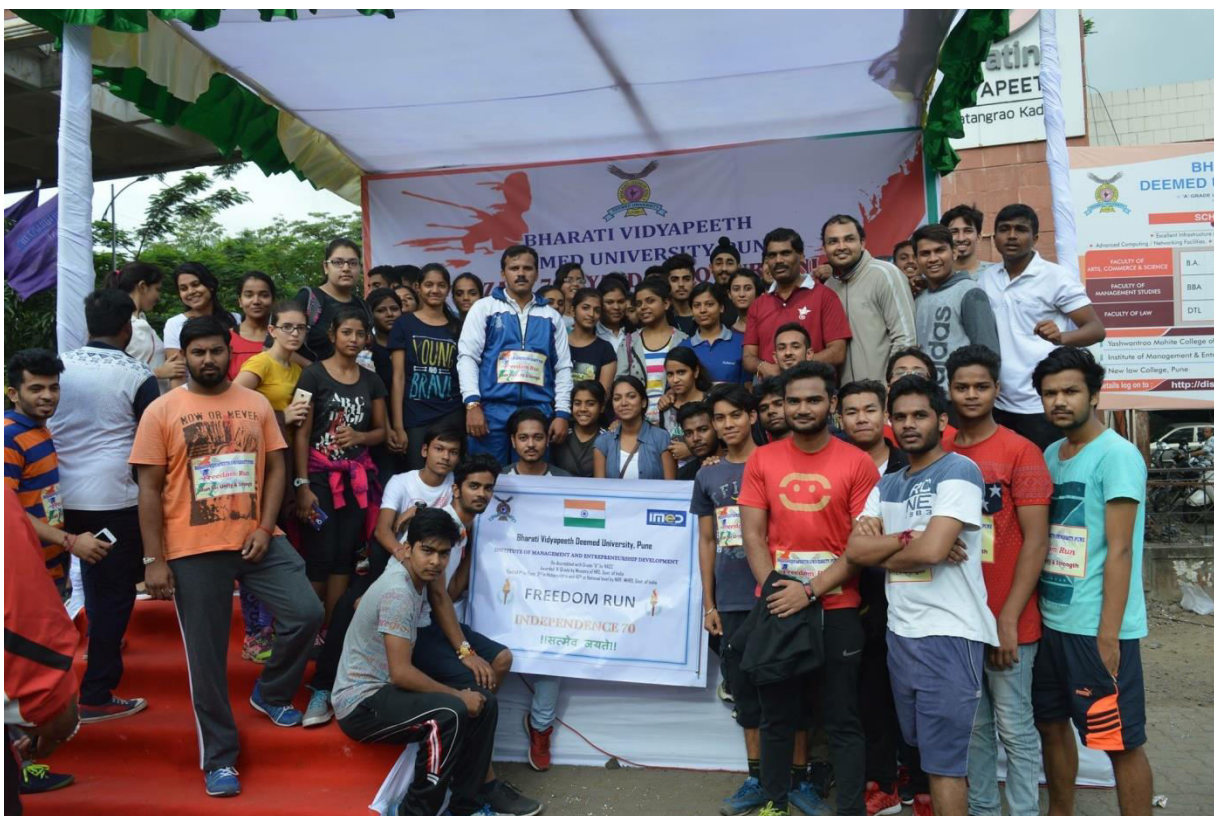
Active faculties and Students of IMED participated in 'Freedom Run'