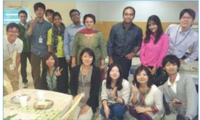
Cross Culture Buddy Program

IMED has always been enthusiastic about making its students familiar with the culture of other countries. One such initiative is taken by the CRC in the Cross Culture Buddy Program in alliance with Softbridge Solutions, Pune. Students of 1st Year MBA Programme interacted with Japanese Project Managers, Human Resource Managers and Software Engineers of reputed companies in Japan like Hitachi, Toyota and Panasonic. The employees discussed about various aspects like education structure, recruitment process, work