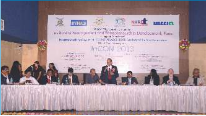
Plenary Session I