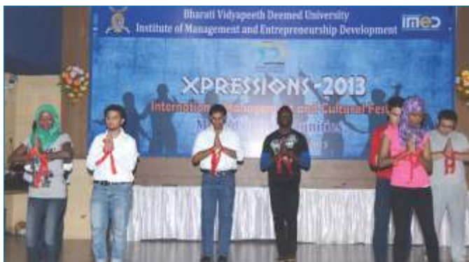
Foreign Students performing at Xpressions.