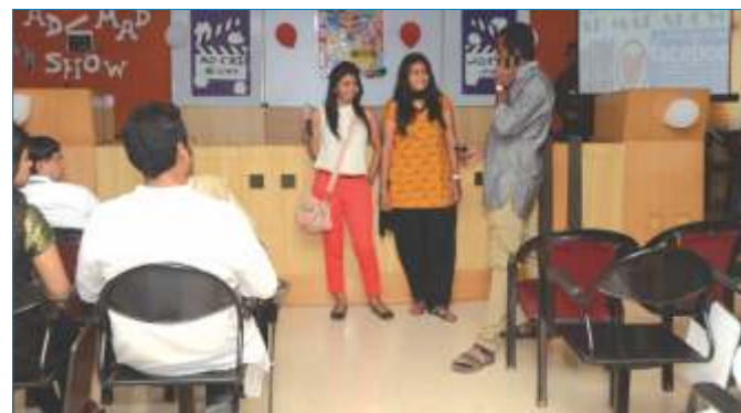
AD MAD Show

Xpressions 2013 consisted of events of four categories Technical, Management, Arts and Musical.