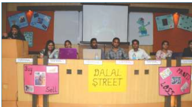
Virtual Stock Market Game "Dalal Street"