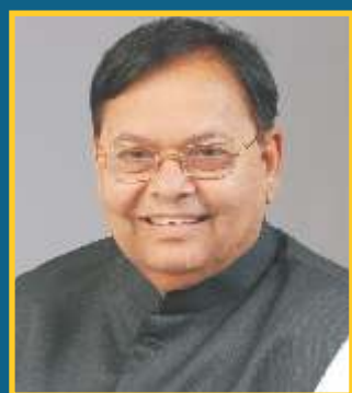
Hon'ble. Dr. Patangrao Kadam

Founder, Bharati Vidyapeeth Founder – Chancellor, Bharati Vidyapeeth University