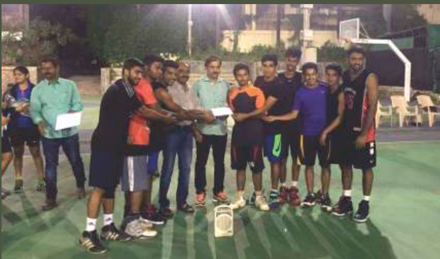
Winners in BVDU Intercollegiate Basket Ball Competition Organized by Dental College