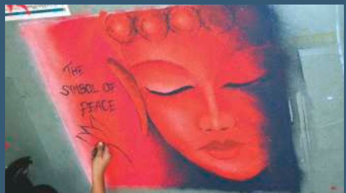
Students' creativity in IMED GEMS