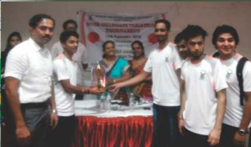
Winners in BVDU Intercollegiate Table Tennis Competition Organized by New Law College