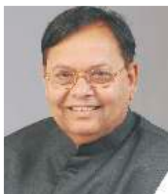
Hon'ble. Dr. Patangrao Kadam Founder – Chancellor, Bharati Vidyapeeth Deemed University