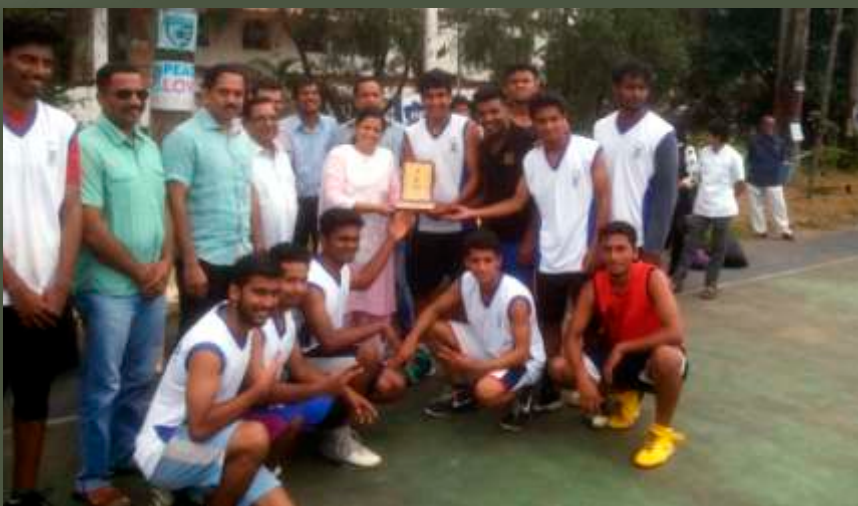
Winners in BVDU Intercollegiate Basket Ball Competition Organized by Medical College