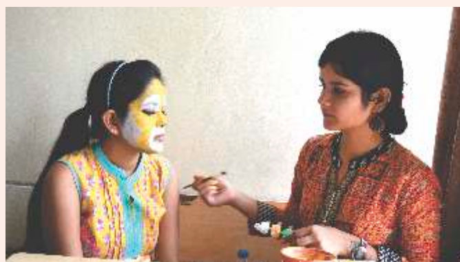
Students participating in IMED GEMS