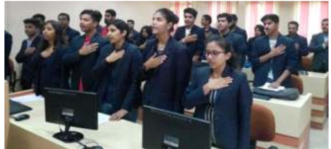
Organ Donation Awareness Programme