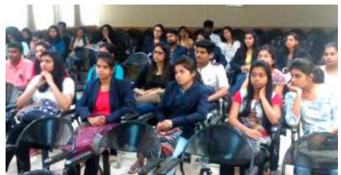
Volunteers present during the awareness activity.