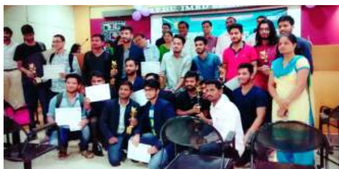
C Googly 2017Winners