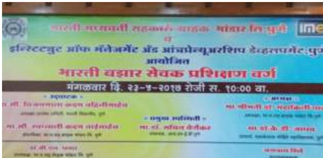
Management Development Program

BVDU Institute of Management and Entrepreneurship Development, Pune in association with Bharati Madhyavarthi Sahakari Grahak Bhandar Ltd Pune organized a one day Management Development Program On "Opportunities and Challenges for Bharati Bazar" on 23rd May 2017 at Yashwantrao Mohite College, Pune. Thirty seven employees from Bharati Bazar Pune attended the Program.