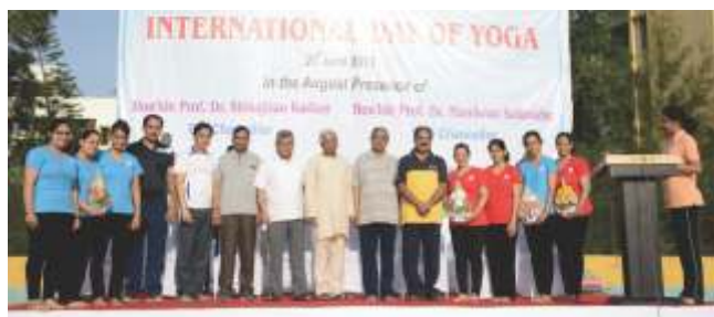
Inauguration of Celebration of International Day of Yoga