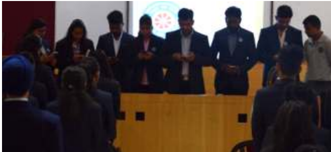
New India Pledge