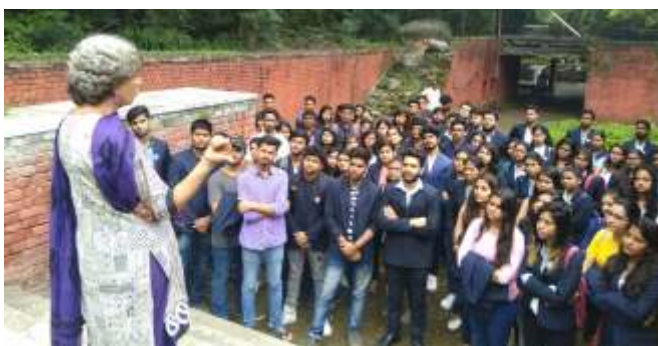
Student volunteers of NSS team of IMED, interacting in an informative session at Aga Khan Palace, a historical place in Pune on September 2, 2017