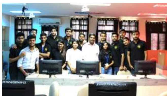
LAN Gaming Coordinators