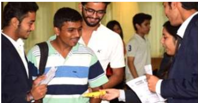
Distribution of bananas after the activity.