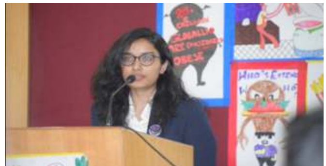
Volunteer spreading awareness on harmful effects of junk food.