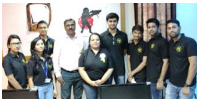
Students with faculty Event Co-ordinator