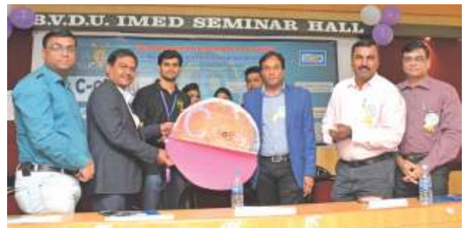
Inauguration of C-Googly at Seminar Hall

The event was partially sponsored by 'allevents.in' and "TravlOnCards"; allevents.in sponsored T-Shirts for student coordinator while other as kind sponsorship in terms of vouchers were given to winners among participants which can be redeemed as per requirement