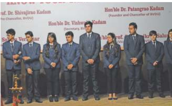
KYC at a glance....