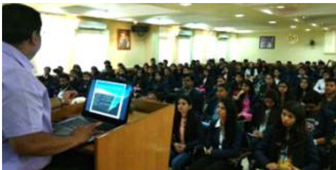
Awareness On Junk Food